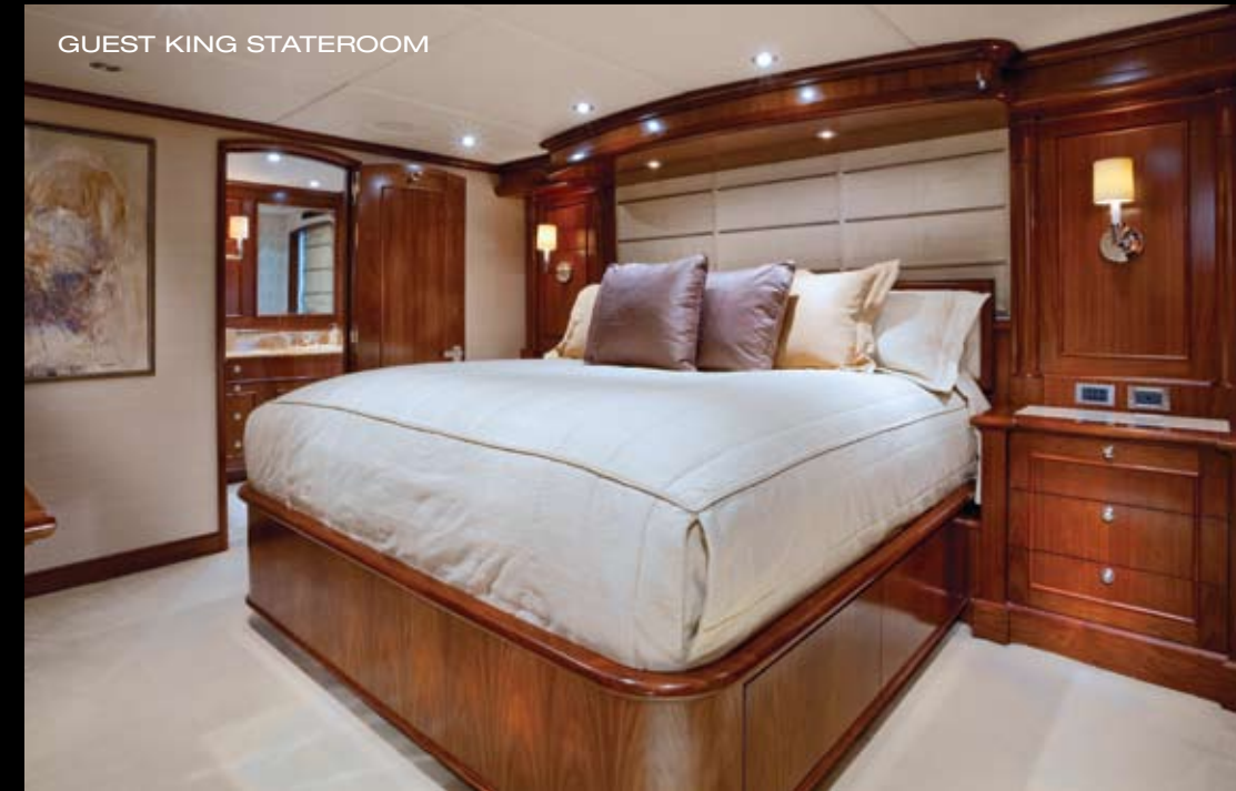
GUEST KING STATEROOM