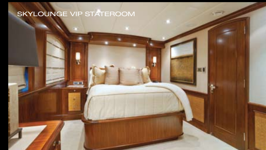
SKYLounge VIP STATEROOM