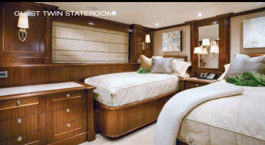
GUEST TWIN STATEROOM